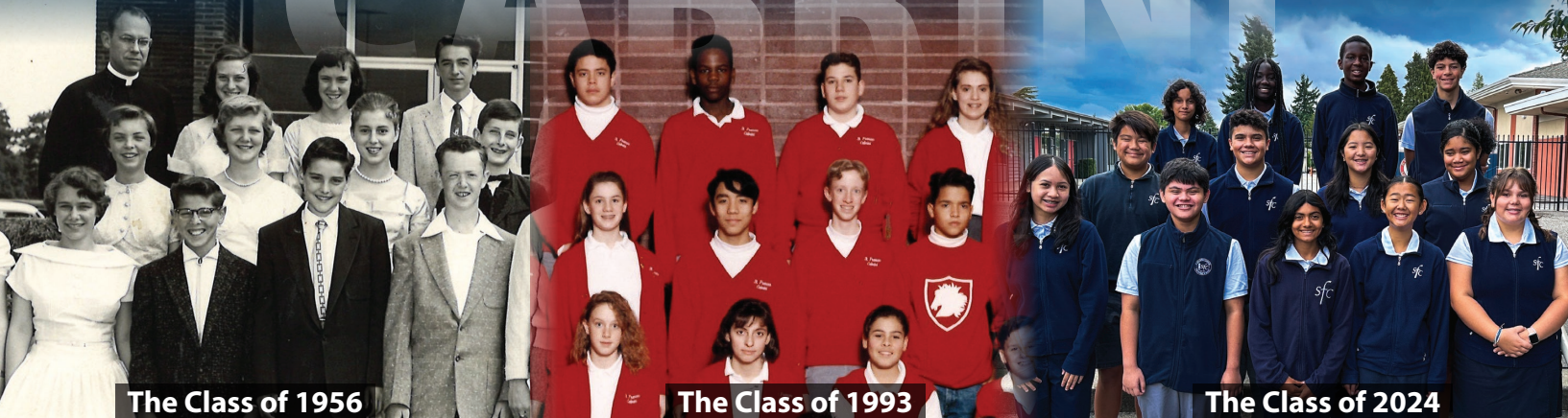
The Class of 1956