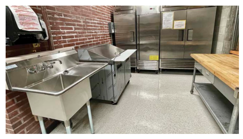
We are so excited to see our new kitchen and new flooring! Thank you to everyone who contributed to the annual giving campaign and auction.